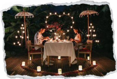
Candle light Dinner